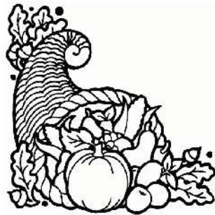
Or the horn of plenty, the Cornucopia, in which Tyche keeps all her gifts & wealth