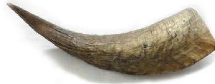
horn of plenty