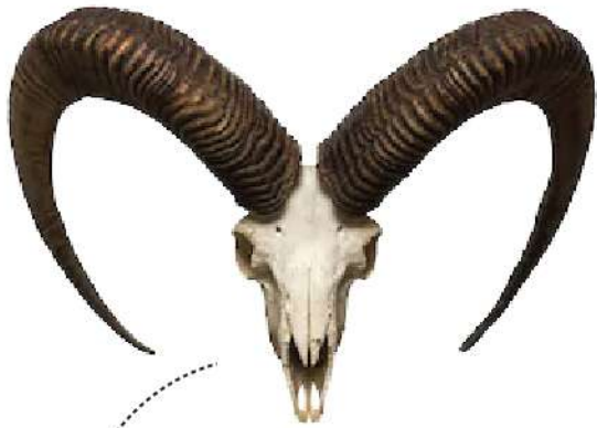
The goat horn